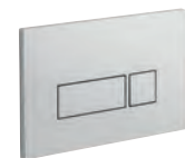
Square Flush Plate 245 (W) x 160mm (H)