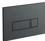
Square Flush Plate 245 (W) x 160mm (H)