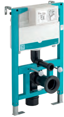
Short Frame and Cistern For Wall Hung Pan 500 (W) x 825 (H) x 155mm (D) WM* 500 (W) x 835 (H) x 135mm (D) DM**