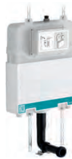
Standard Cistern For Back to Wall Pan 454 (W) x 795 (H) x 135mm (D)