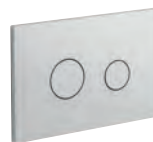
Round Flush Plate 245 (W) x 160mm (H)