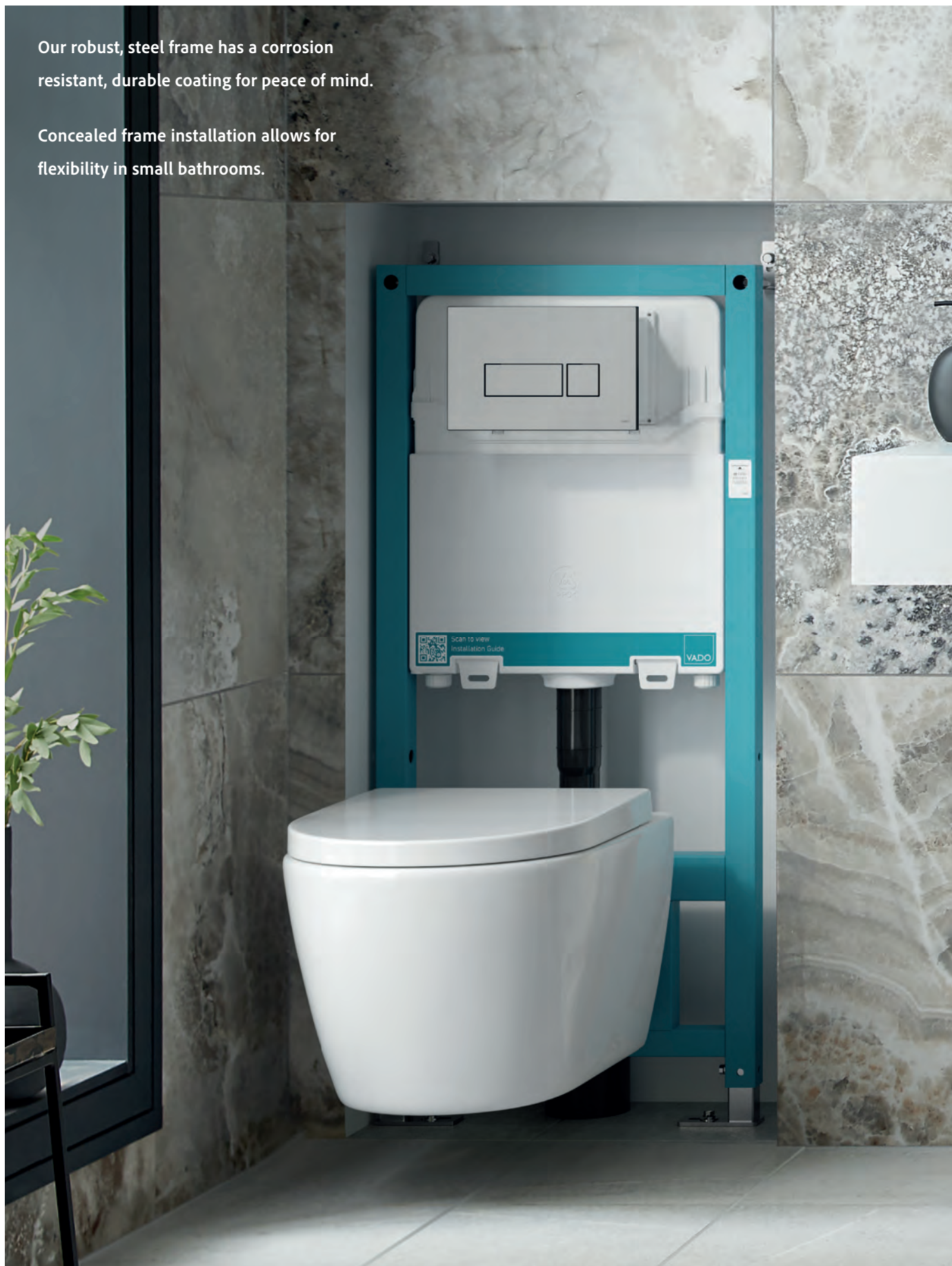
Image to show standard concealed frame and cistern, this would not be visible once installed.

Concealed frame installation allows for flexibility in small bathrooms.