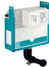
Short Cistern For Back to Wall Pan 420 (W) x 540 (H) x 152mm (D) WM* 420 (W) x 540 (H) x 132mm (D) DM**