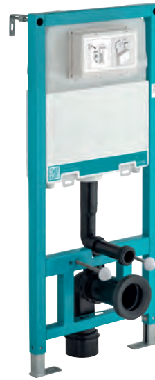
Standard Frame and Cistern For Wall Hung Pan 505 (W) x 1135 (H) x 155mm (D)