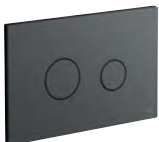
Round Flush Plate 245 (W) x 160mm (H)